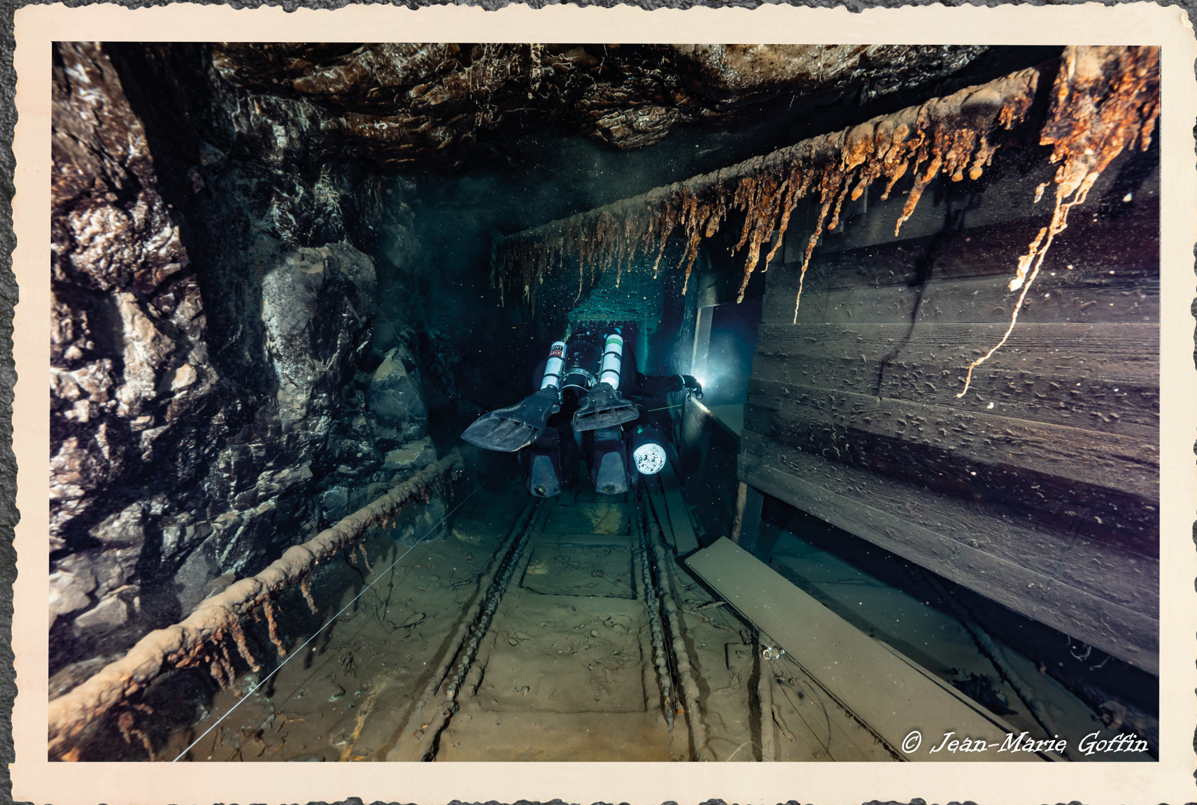
In the flooded descent

This quarrying site is located in a part of the concession that cuts across the land exploited by the Renaissance slate mining company, which had been expanding rapidly since the late 1880s. Initial work focused on the workings taken over from the Saint-Gilbert slate mine, whose underground galleries adjoin the western part of the Sainte Anne concession . To the south of the latter, the Pied Selle site was opened up along the Fumay to Revin road. The site was created in 1894 in the wake of negotiations between the slate mining company and the Société Anonyme des Usines du Pied Selle , now a cable company, to exploit its subsurface. The site of this new pit head is today home to a supermarket and a car dealership.