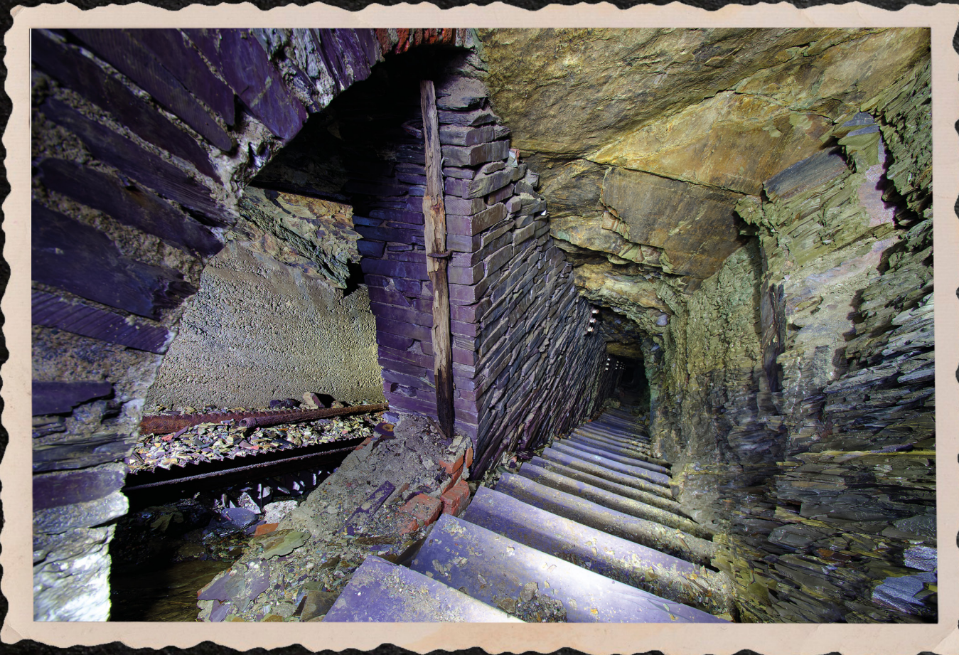
In the descent