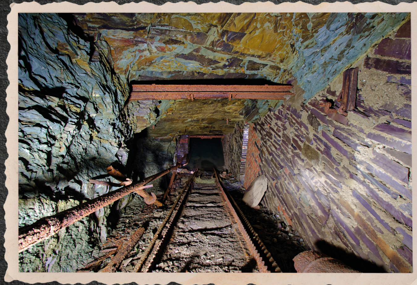
The descent and its technical equipments are still in place