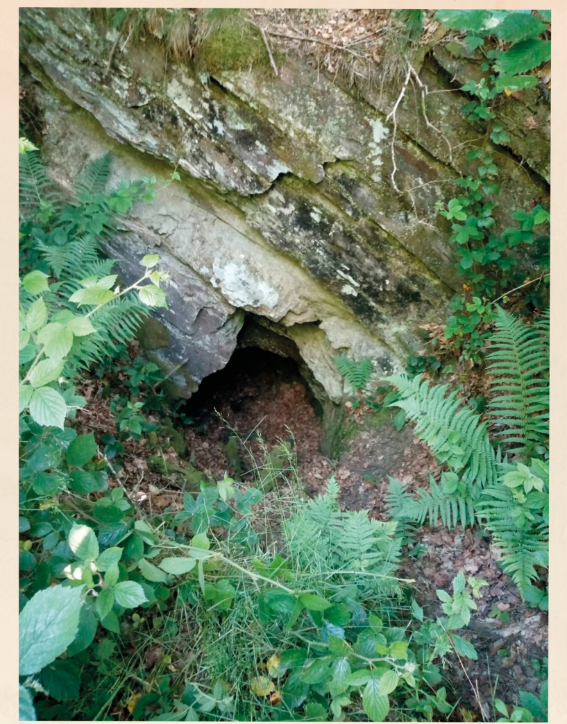
Secondary entrance to the gallery inclined towards France, 200 metres before the border on the left.