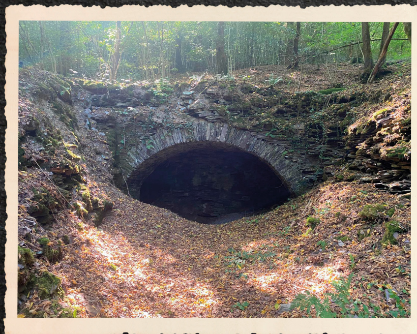
The Sauveur Slate mine