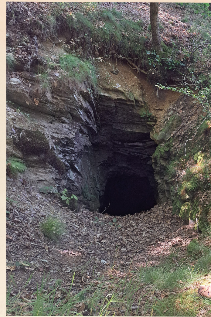
Main entrance to the Trou du Diable slate mine