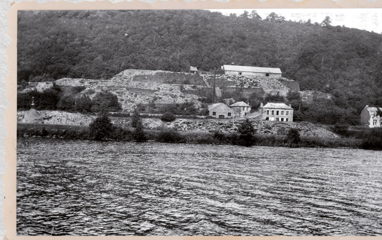
The Providence slate mine during the 1914-1918 war

As is the case in Haybes, the trail cannot take in all the slate mines in Fumay and Oignies-en-Thiérache.