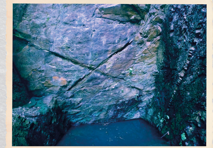
The Sainte-Barbe slate mine, one of the flooded entrances