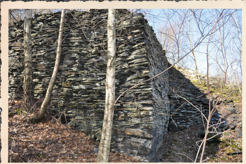
The Saint-Paul slate mine of the retaining walls