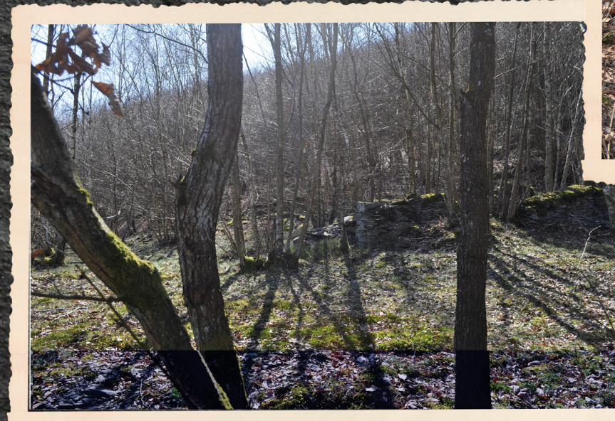
The Saint-Paul slate mine, remains of the workshop or “Hayons”