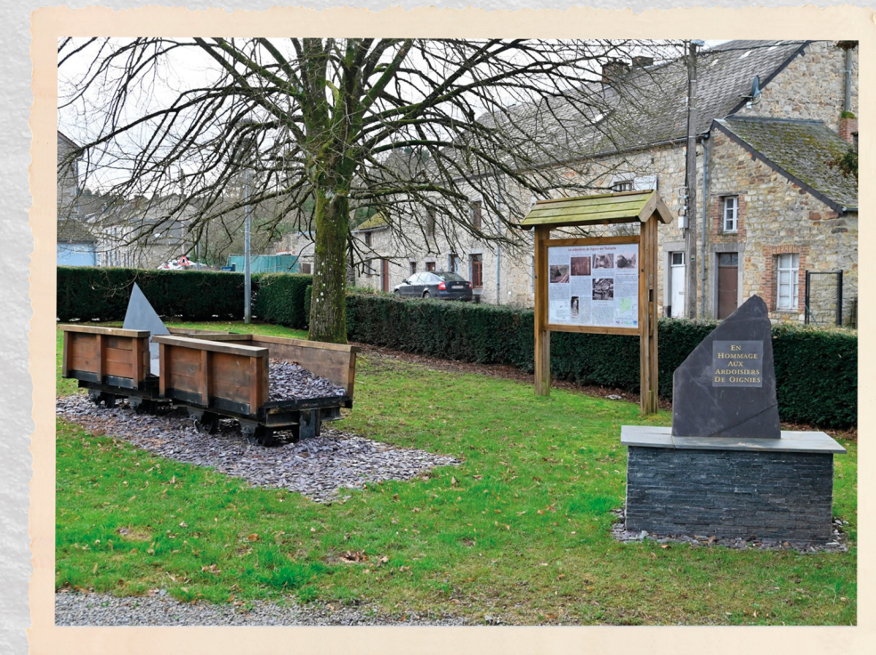
This memorial site was erected as a tribute to the Oignies slate mines - 1922 on the Place du Baty

You can find all this information on the joint website: "The CATAREX Cross-border Slate Trail" and on the CATAREX Facebook and Instagram pages .